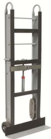
Figure 1 272410 (Single Ratchet)