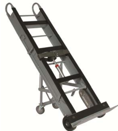
Figure 3 272412 (Vending)