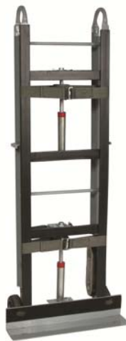
Figure 2 272410 (Double Ratchet)